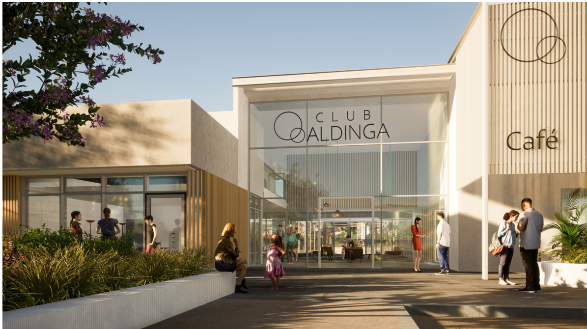
Aldinga masterplan and residents' club and swimming pool