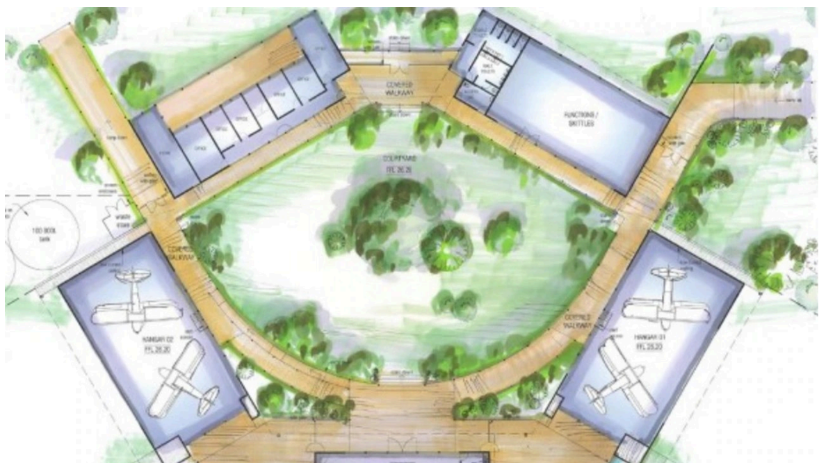
Rendered image of proposed new Aldinga airport supplied to The Advertiser by MPG Architects

Public consultation on a proposed new airport adjacent the current facility at Colville Road comprising two aircraft hangars, a tourist flight facility, new airstrip, cellar door with viewing deck, restaurant function centre, offices, storage, toilets, rainwater tanks, associated on-site car parking, landscaping, vineyard and a new water feature closed on January 8 th 2024.