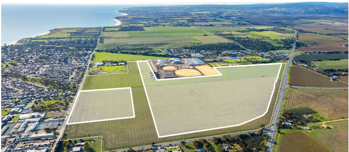
Tender document for the new masterplanned suburb at Aldinga

The City of Onkaparinga collaborated with community and business leaders to develop a prospectus for a sustainable development at Aldinga and Renewal SA are currently selecting a developer to undertake the project which will likely provide more than 800 dwellings. A timeline and update on this process can be found at the Renewal SA website and you can find council's prospectus on their website .