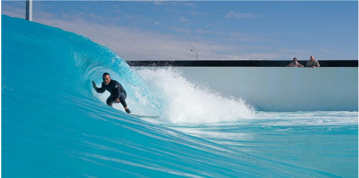
Urbnsurf is the only surf park in Australia currently open to the public.

and further parking around the accommodation units and at the service entrance off Bowering Hill Road. The development will be assessed by the Council Assessment Panel, however it has not required public notification due to the fact it is proposed for land already zoned for such a tourism development. The main concern of FOPW and Friends of Willunga Basin is how the development and its landscaping will respond to the Character Preservation legislation overlay, and to the sustainable management of energy and water consumption and disposal of waste water.