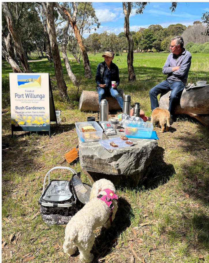
Friends of Port Willunga Bush Gardeners (and dogs) enjoying the new picnic area at the end of Mindarie Street