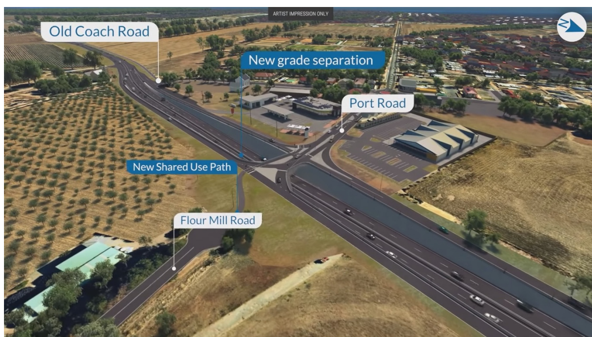
Stage 1 of the Main South Road duplication and Gallipoli-style underpass is under construction at Aldinga.

https://www.dit.sa.gov.au/_data/assets/pdf_file/0007/1154716/DIT-MSRD-S2-07-Concept-map-roll-plot-Updated.pdf with more information at https://fcalliance.com.au/projects/main-south-road . Friends of Willunga Basin are leading a campaign for the current plans be put aside and a new lower-impact design to be brought forward, and will present these views at the FOPW AGM.