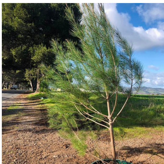
Baby Aleppos now fill the Port Road heritage avenue gaps thanks to FOPW lobbying over 20 years

The future of the Aldinga green triangle is once again under question due to the new government's decision to move the future train terminal site and railway corridor a further 1000 metres south of its original location on the triangle. In December the Friends of Port Willunga wrote to transport Minister Koutsantonis to raise our concerns about impacts of the new train terminal location on the quality of the design of the new suburb, on the Aldinga Arts Ecovillage farm and the implications for preservation of the triangle as regenerative open space. In the meantime, after ongoing lobbying from FOPW, Council's street tree team have finally filled in the gaps in the heritage-listed avenue of Aleppo pines along Port Road and removed the excessive car park signage that was installed with the opening of the new school.