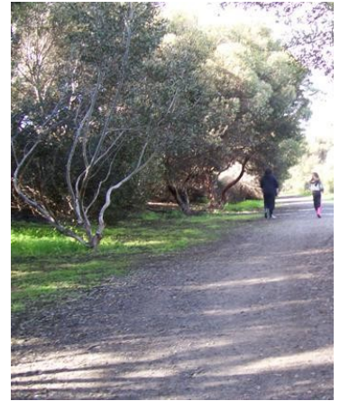
The existing hard surface of the Mindarie Street walking track is difficult to walk on in bare feet